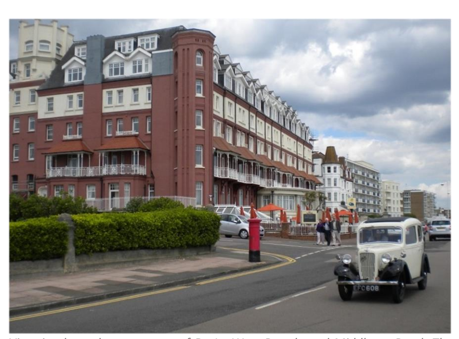
Victorian letter box at corner of De La Warr Parade and Middlesex Road. The Sackville Hotel opened in 1890 so this box would have been ideally situated to serve its residents.

Within the TN39 and TN40 postal districts there are 88 letter boxes. 69 of these are pillar boxes (tall cylindrical boxes), 9 are wall boxes (flat rectangular boxes set into walls) and 9 are lamp boxes (small boxes often attached to lamp posts or telegraph poles). In addition there is one non-standard box on the ground floor of Bexhill Hospital. Six boxes carry Queen Victoria's cipher, five are King Edward VII boxes, 30 are King George V boxes, seven are King George VI boxes and 39 are Queen Elizabeth II boxes. There are no King Edward VIII boxes, in fact there are only about 160 such boxes in the whole country.