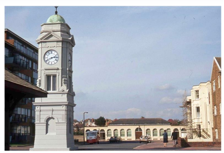
West Parade Coronation Clock Tower, c1980.

Bexhill's Coronation Clock Tower came to the attention of Bexhill Heritage when we were approached by residents of Clock Tower Court as to whether the clock could be restored to strike as it did up to the 1960s. We asked Rother District Council to give us access to the tower and see if we could assess the feasibility of the restoration of the Bell which currently resides in the basement of Bexhill Museum.