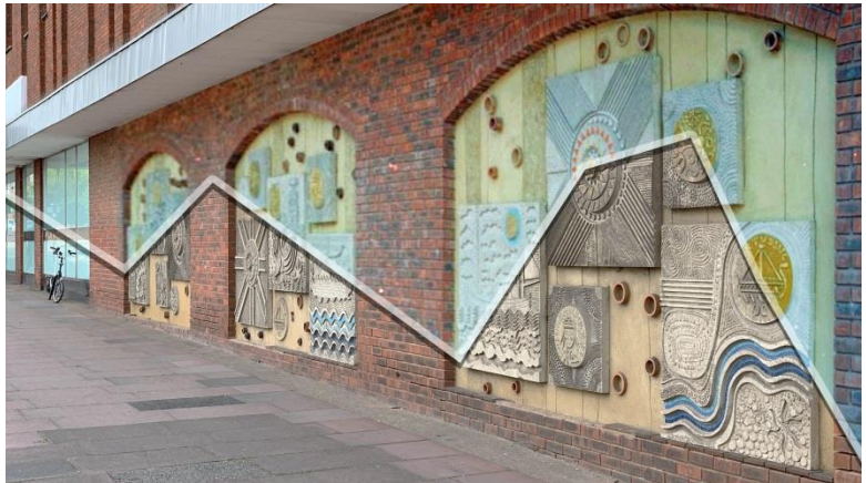
Top: 1976 – bright and clean | Bottom: 2019 – in desperate need of a refresh

Opposite the Town Hall you may have noticed a concrete mural commissioned by J. Sainsbury Plc, revealed when the supermarket opened in June 1976.