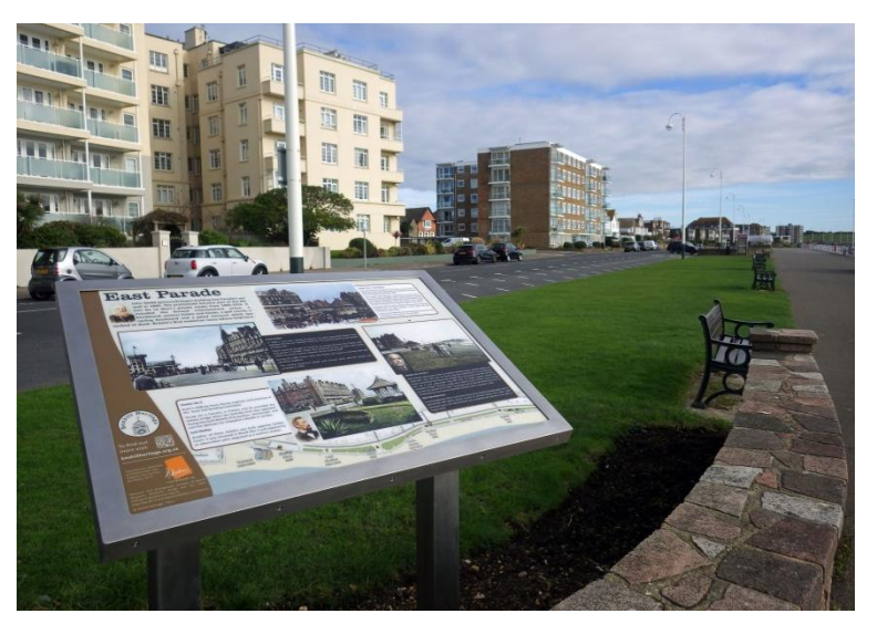
The new interpretation board, detailing the history of East Parade and its shelters.

Help select this year's Civic Pride Award Winners from three categories; shop fronts, public open spaces and building restorations.