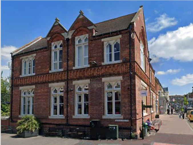
Bexhill Library, Western Road

This Gothic architectural building was erected in 1893 as a school by Rev. E. Mortlock, under the auspices of St. Barnabas' Church.