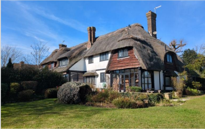
The Thatched House, Pinewoods